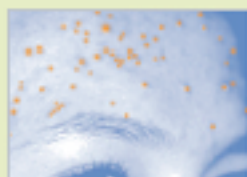
nimue skin scanner analysis