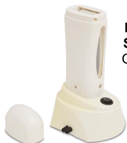
PQRU-S Single Roller unit with base

800g Wax Heater + 500g Wax Heater Each has its individual variable temperature control On/ Off switch 350W/220V ABS plastic Transarent ABS lid